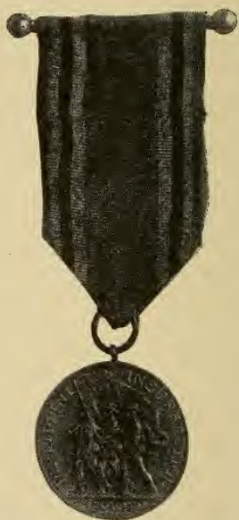
UNITED STATES CON- GRESSIONAL MEDAL

Americans there endured pain and suffering, the depth of which Washington's Army at Valley Forge never reached. Those old Continentals had nothing in discomfort on these modern heroes in front of Croane. Washington's Army, in their own country, had access to the necessities of life. They held communion with their fellows. These later-day Americans, un-